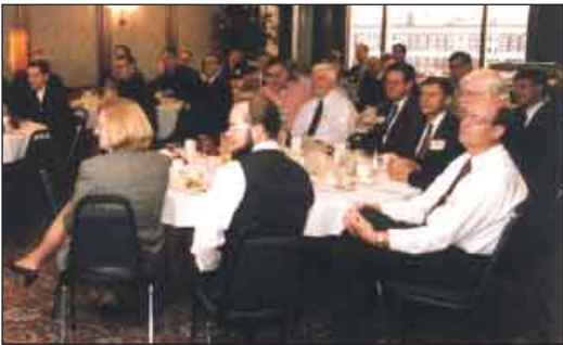
Community leaders from around Indianapolis gather monthly for breakfast at 2820 North Meridian, Indianapolis.

Both your workplace and your home are affected by the character you demonstrate. However, it can be difficult to identify some of the practical applications of the character quality of the month. That is one of the reasons CCI participates in hosting a monthly character focus' breakfast in Indianapolis.